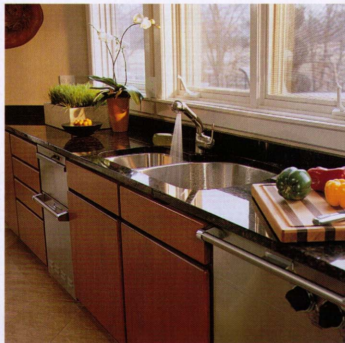
Opposite: Polished marble floors, Brookhaven maple cabinets by Wood-Mode and gleaming stainless steel give this kitchen its contemporary edge. A door in the wall of windows leads to the pool area. A trio of glass sculptures hangs on the wall. Above: Opposite the range and microwave, the cleanup station features undermount stainless-steel sinks, a trash compactor and dishwasher.

What they had in mind, they told Andi Stephens, a kitchen planning consultant with Kitchen Distributors, in Fayetteville, was a room that was warmer than the existing space. They also wished to trade up from their 48-inch side-by-side refrigerator-freezer and have a place to store their extensive wine collection. Finally, they wanted to