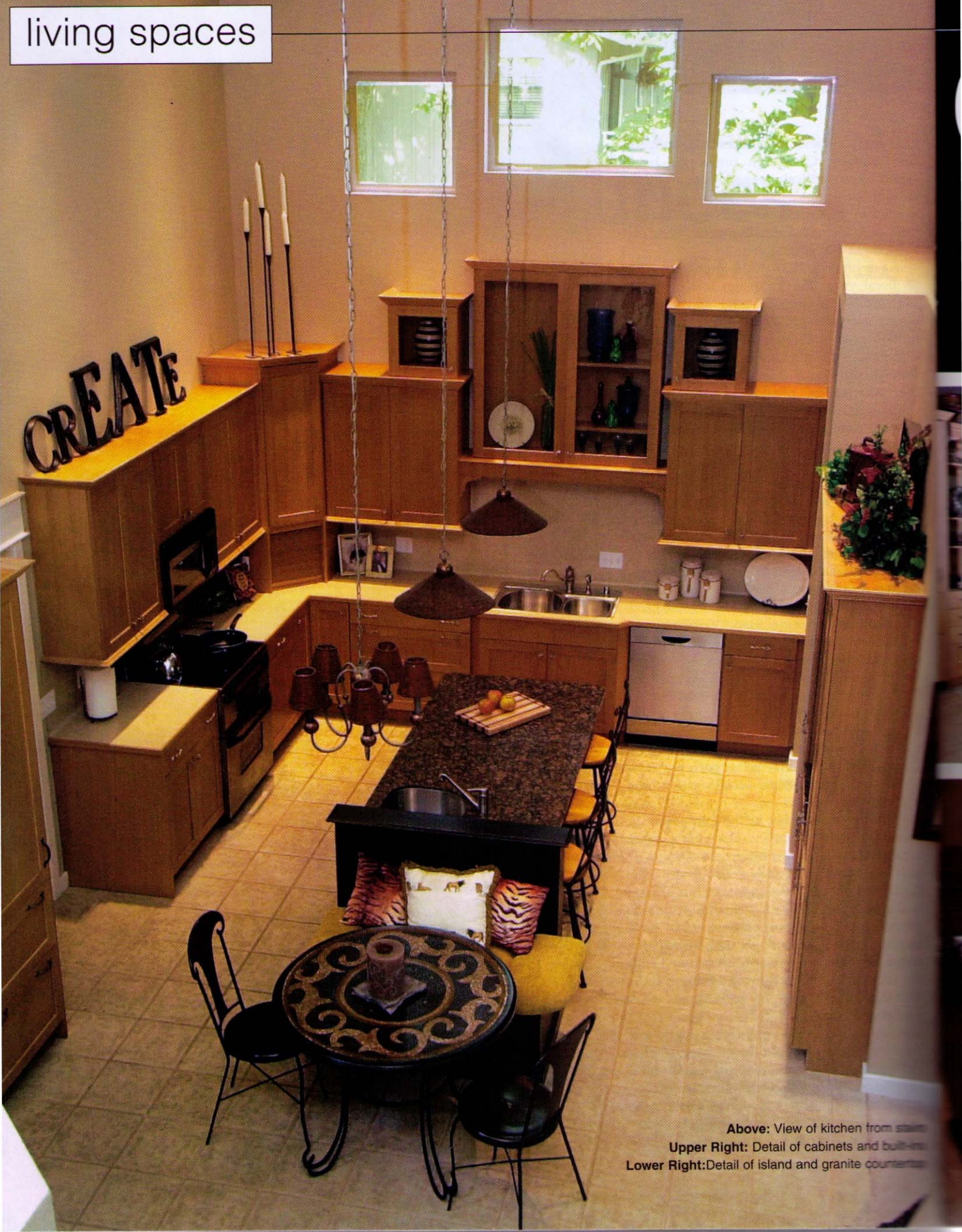
Above: View of kitchen from stairs Upper Right: Detail of cabinets and built-ins Lower Right: Detail of island and granite countertop